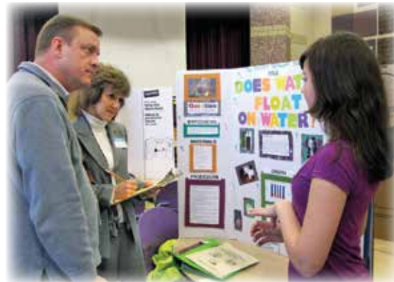
Below: A Middle School student answers questions about her project. Grants help fund Science Fairs and other educational experiences that prepare our students for college.