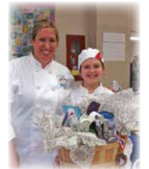
Above: 2014 Winner of the Bell Creek Future Chef Competition.

The Bellbrook-Sugarcreek Education Foundation is dedicated to ensuring excellence in education through public and private partnerships so individuals can achieve their goals.