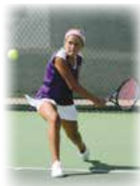
Left: Sports, Academics and Arts all benefit from BSEF. Below: Fund Management provides for the distribution of major allocated funds such as the MVS Stadium.