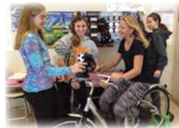
Left: BHS students ride the DP&L Energy Bike.