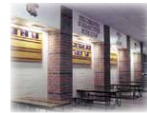
Left and: The Bellbrook / Sugarcreek Hall of Fame, sponsored by BSEF, is a fine inspiration for our students to learn from these examples and be encouraged to achieve their best.