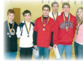
Above: Middle School students pose for Science Fair award photos.