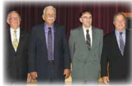
Left: Individuals from our graduates, school staff and citizens of our community are installed each year into the BSEF sponsored Bellbrook / Sugarcreek Hall of Fame.