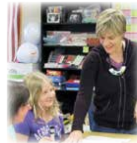
Above: a teacher uses Voice Enhancement to be clearly heard by the entire class.