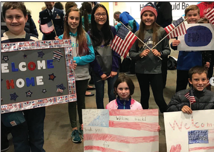
BCI families participated in the Welcome Home Celebration for an Honor Flight at the Dayton International Airport!