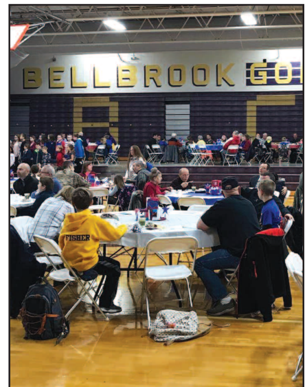
Festival Committee in partnership with BCI staff, volunteers and Sodexo School Services.

The Veterans Day Breakfast was sponsored by the Sugar Maple