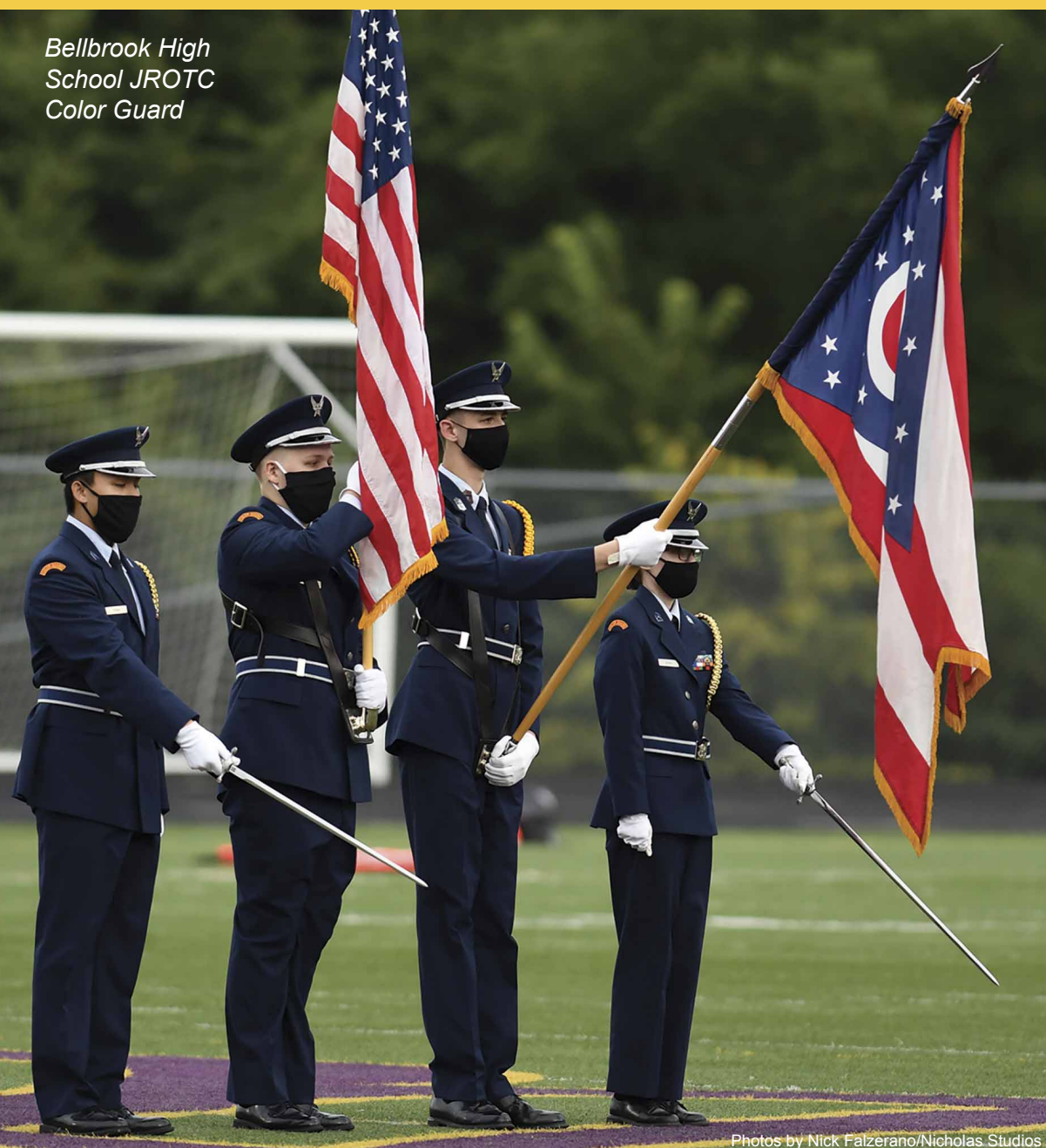
Bellbrook High School JROTC Color Guard