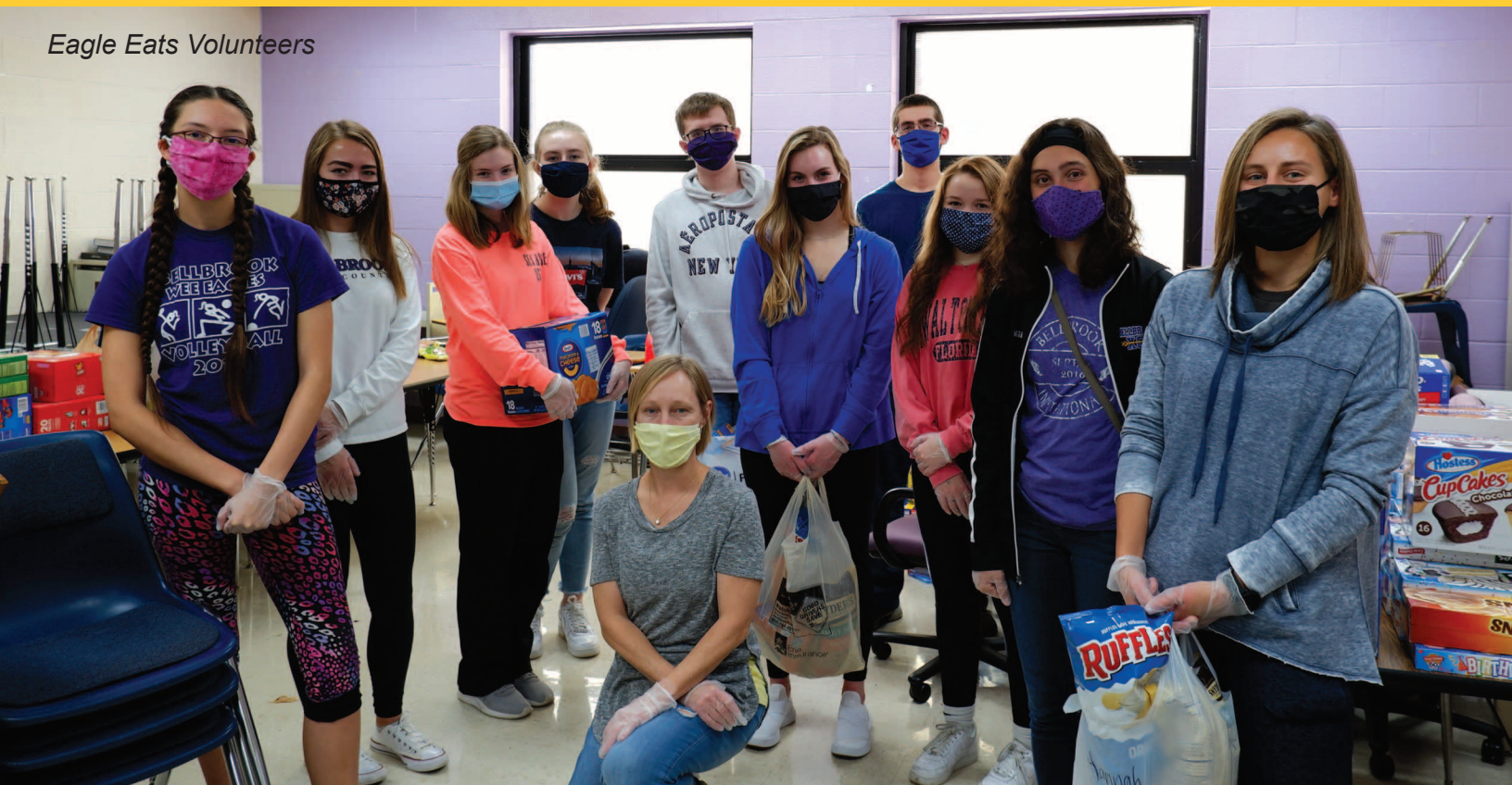
Eagle Eats Volunteers

Serving the students of the Bellbrook-Sugarcreek community since 1976